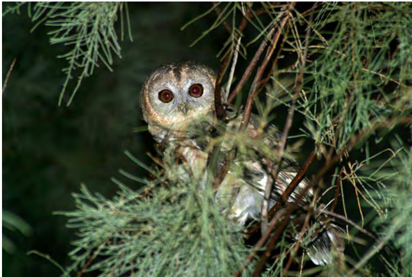
Figure 13 Hume's Tawny Owl photographed at the entrance of Wadi el-Gemal