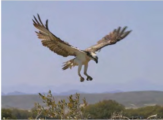
Figure 7 Osprey is a common inhabitant of the Red Sea coast—here one is hovering over the Hamata Mangrove

This is a rare resident breeder. At least one pair probably breeds in WGNP. Single adults have been seen in the past 5 years near Sheikh el-Shazeli, near the summit of Gebel Hamata, and on the coast just north of the Shams Alam Hotel. Local inhabitants describe it as resident and are familiar with its bone-breaking practices. It is likely to be