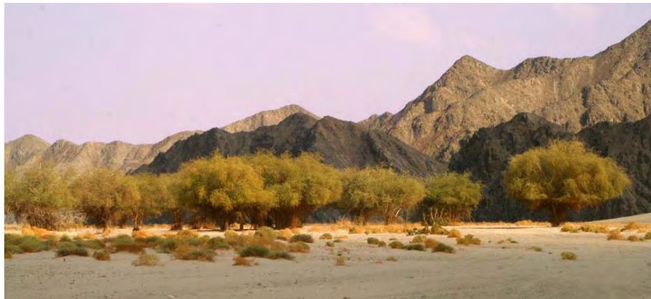
Figure 1 Balanites aegyptiaca grove in the central area of Wadi el-Gemal National Park

One of the exciting aspects about this region is the fact that it is ornithologically under-explored and studied. Visitors have a good chance of making significant discoveries that can add to the scientific knowledge of this fascinating part of the world.