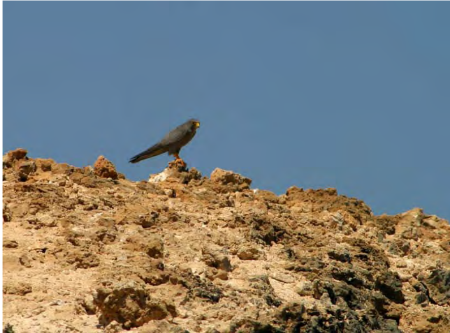
Figure 12 Several hundred pairs of Sooty Falcon breed on the islands of the Wadi el-Gemal National Park

A common migrant breeder, several hundred pairs nest on the islands of Wadi el-Gemal and the Hamata Archipelago. Birds return to Egypt in April and can be seen sporadically throughout the summer along the coast and inland, particularly at dusk hawking for insects and even bats. They start breeding in autumn between August and November to make use of the autumn bird migration. At breeding, birds are concentrated on the islands, but adults can be frequently seen hunting on the mainland. Landing on islands with breeding colonies (during the breeding season) is prohibited, but excellent observations can be made from boats offshore.