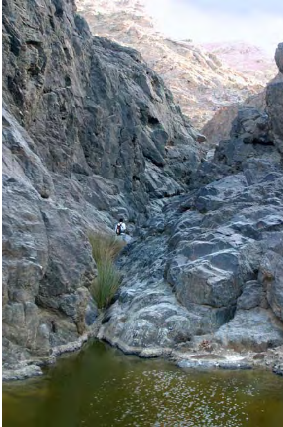
Figure 27 Bir Sartut

Bir Sartut is a permanent brackish water source at the foothills of Gebel Hamata. It is composed of a series of small waterholes scattered along the upstream part of Wadi Sartut. These waterholes attract a variety of resident birds, particularly Lichtenstein's Sandgrouse, Sand Partridge, and Trumpeter Finch, all of which come here to drink. This is also one of the best places to see resident Bonelli's Eagles and Lammergeyers.