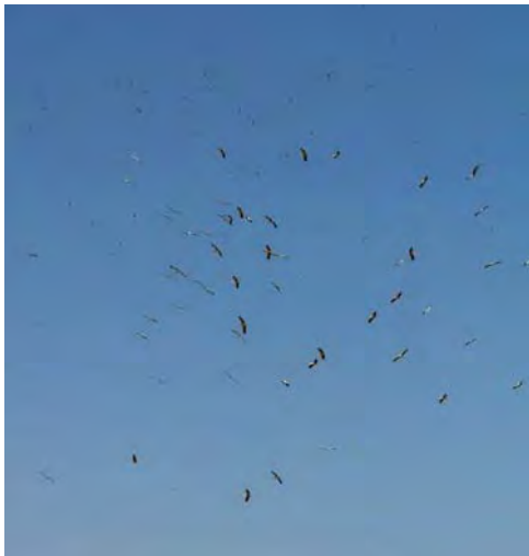
Figure 3 Without the use of binoculars, most migrating raptors appear to be dots in the sky

The most spectacular migration is that of soaring birds. Large birds of prey and storks migrate along the Eastern Desert mountain ridge utilizing the hot thermals rising from the desert. From February to June and from October to December of each year these birds can be seen soaring anywhere along the Eastern Desert mountains; but the best places to see these birds are at bottlenecks near Gebel el-Zeit, north of Hurghada, at Ain Sukhna, and Suez, where these birds tend to concentrate in larger numbers.