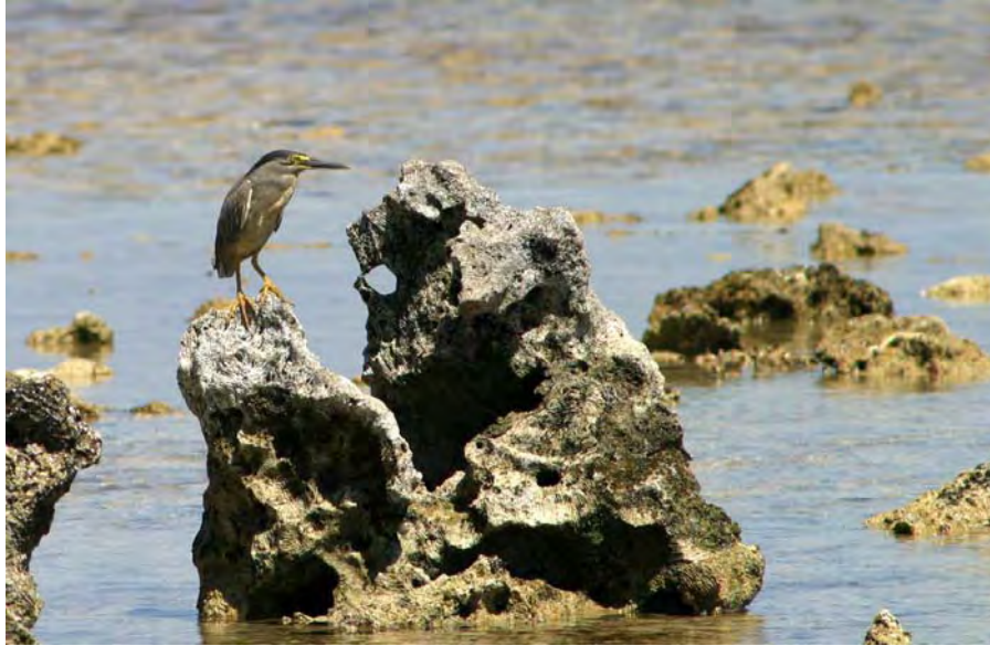
Figure 4 Green Heron

Visiting the offshore islands can provide the opportunity to get closer looks at some seabirds, which are scarce near shore. However, the Red Sea is rather poor in pelagic species and one would not expect to add many species to his list on a deep sea trip.