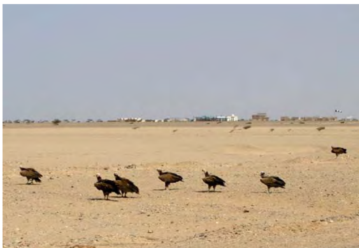
Figure 10 Egyptian Vulture is frequently seen at carcasses throughout the region