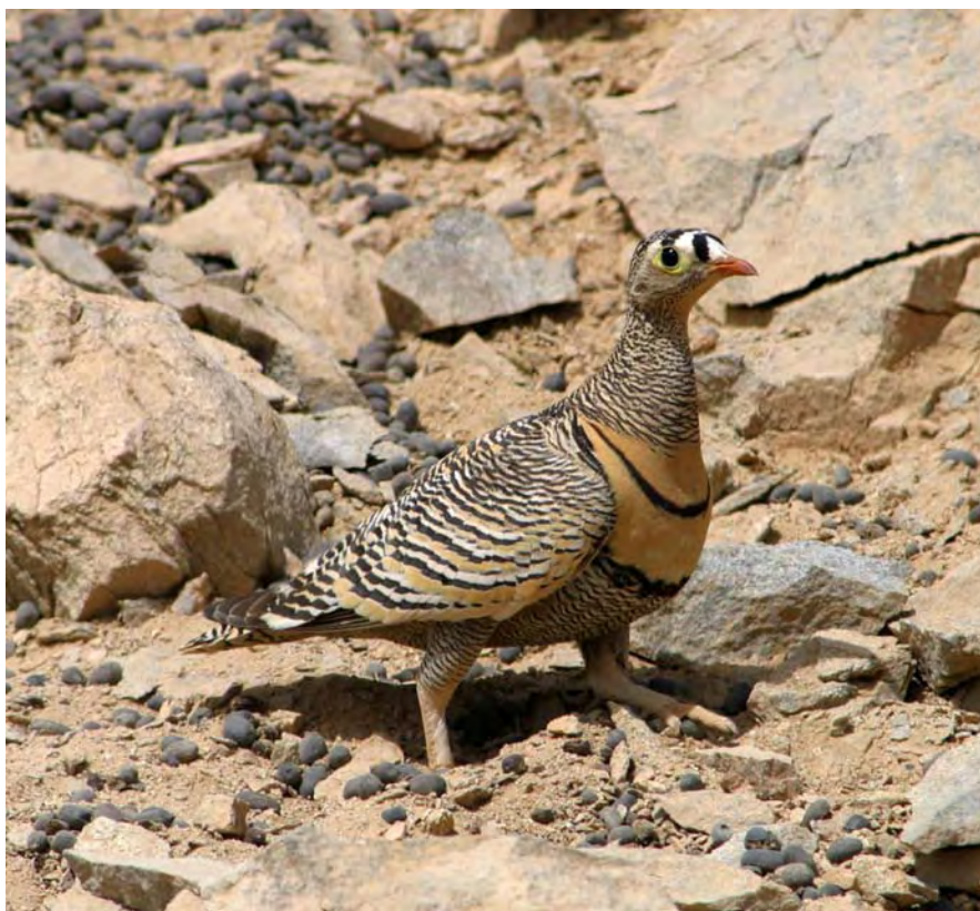
Figure 14 Male Lichtenstein's Sandgrouse feeding near native houses in Wadi Abu Ghusoon

An uncommon and localized resident breeder, they inhabit rugged mountainous desert with Acacia scrub. The species is best seen at or near waterholes. Their distinct calls can be heard ringing in the hollow wadis as they arrive in small groups to drink, just after dusk and well after darkness. If you wait quietly (not too close to the waterhole) the birds will land right next to you. You will need a flashlight to see them properly. The best waterholes in WGNP are Bir Wadi el-Gemal, Magal Um Sweih, Bir Sartut, and Bir Hafafit. The species can also be seen opportunistically in some of the wadis during the day, but they are very well camouflaged and difficult to spot even at close range, as they sit motionless on the ground. Wadi Shawab, Wadi Amira, and Wadi Abu Ghusoon are good places to look for them on the wadi bed.