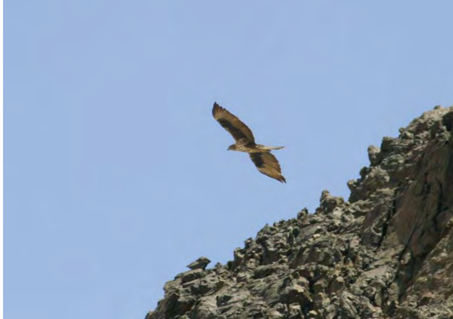
Figure 11 Adult Bonelli's Eagle soaring near the summit of Gebel Hamata

A rare resident breeder and migrant, it can be readily seen around the higher elevations of Gebel Hamata and Gebel Sartut, where two or three pair have recently been found breeding. The species can be seen throughout the year and local inhabitants describe it as resident. The species is also known to nest further south at Bir Abraq, Gebel Garf, and Gebel Elba.