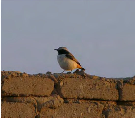
Figure 18 Kurdish (Red-tailed) Wheatear is a rare winter visitor to the Eastern Desert. This bird was found at Shalateen

A rare winter visitor thinly distributed through the region, although quite common on Gebel Elba. Mostly found in the high mountains in small wadis with steep sides, usually where there is some reasonable vegetation cover. It has also been observed in some of the Red Sea coastal urban centers, where it prefers areas of abandoned buildings.