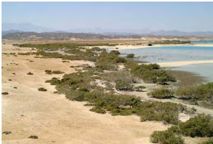
Figure 22 Mangroves at Qulan

This is one of the most extensive mangrove stands in Egypt. The intertidal flats surrounding this mangrove attract many migrating shorebirds. This is one of the best locations to see Crab Plovers and Goliath Herons in Egypt. Odd Pied Kingfishers Ceryle rudis have been observed here.