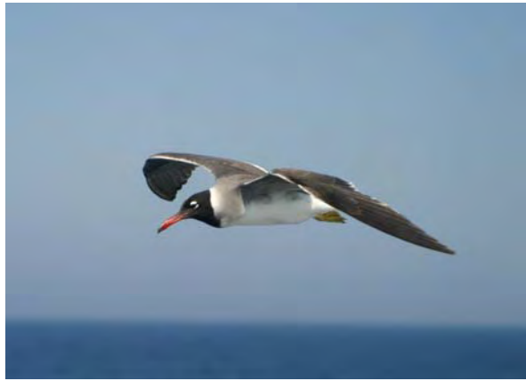
Figure 17 White-eyed Gull is essentially a Red Sea endemic

This is a common resident and migrant breeder found throughout the year in the region, but with some regional dispersal. Most adults migrate further south during winter months, leaving behind many juveniles and immature birds. Any visitor to the Egyptian Red Sea is certain to see this species with ease. The breeding season on the