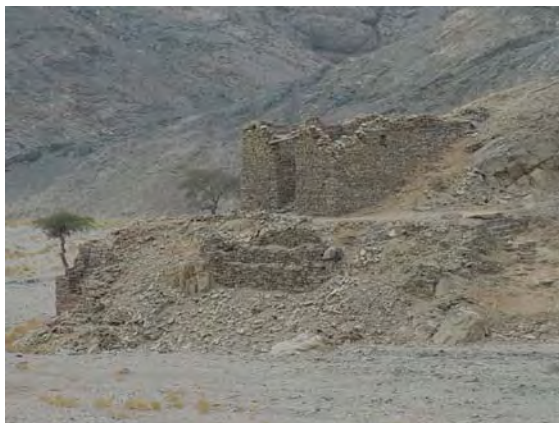
Figure 26 Roman Ruins in Sekit

To get to Bir Wadi el-Gemal, continue along the main course of Wadi el-Gemal for about 16 km beyond the Ranger Outpost.