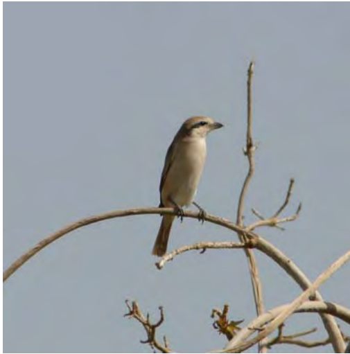
Figure 20 Isabelline Shrike at Shams Alam Hotel

A rather uncommon but regular migrant through the region, this shrike is mostly seen along the coastal highway in and near hotel gardens. A few individuals also spend the winter locally.