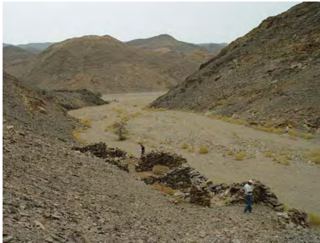
Figure 25 Sekit

Continue along the midstream part of Wadi el-Gemal for some 20 km. When you reach the Ranger Outpost at the wadi junction, follow Wadi Nugrus. Another 2 km further up this wadi , Wadi Sekit branches off to the right.