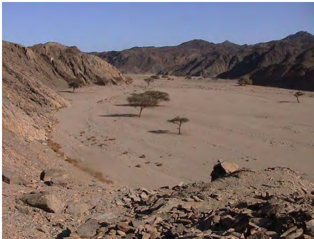
Figure 24 Nugrus

Some 41 bird species are known or thought to breed in the immediate vicinity of Elba. These include species not breeding elsewhere in Egypt, such as: Bateleur Terathopius ecaudatus , Namaqua Dove, Fulvous Babbler Turdoides fulva , Nubian Nightjar Caprimulgus nubicus , Black-crowned Finch Lark, Shining Sunbird Cinnyris habessinicus , Red Sea Warbler Sylvia leucomelaena , Rosy-patched Shrike Rhodophoneus cruentus , Long-billed Pipit Anthus similis , and possibly African Silverbill Euodice cantans , and Sudan Golden Sparrow Passer luteus . The area also holds breeding populations of several birds of prey that are rare or have sharply declined throughout the remainder of their range in Egypt. These are Lammergeyer, Egyptian Vulture, Verreaux's Eagle and Bonelli's Eagle.