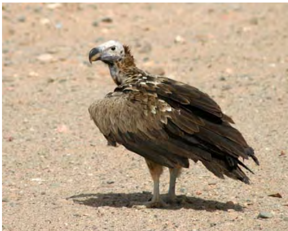
Figure 8 Lappet-faced Vulture is the largest flying bird known in Egypt

This uncommon resident breeder can be found sporadically from Gebel Elba to WGNP, where at least one pair breeds. The best place to see the species is at Shalateen, where tens can be seen feeding on the carcasses of slaughtered camels in and near the town. It is often seen near the coastal highway, feeding on road kills. In WGNP, the species is frequently seen near Abu