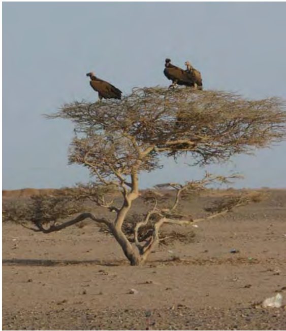
Figure 23 Lappet-faced Vultures

Please inform Elba National Park Rangers (office located at the Park Visitor Center along the main road entering the town) if you find vultures being harassed, or feeding on carcasses very close to the main roads (which puts them at risk of being hit by traffic).