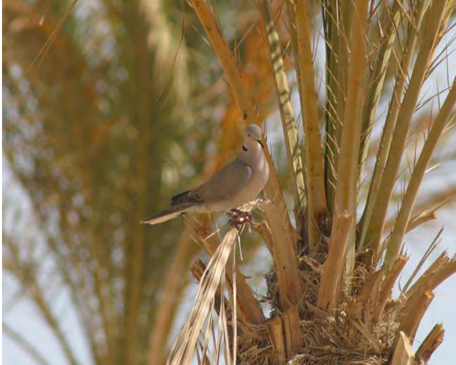
Figure 28 African Collard Dove at the Shams Alam Hotel

The WGNP Ranger Headquarters are found just 100 meters to the south of the hotel. Walk there to inquire about arrangements to visit the interior of the Park, and to ask about recent bird observations in the area.