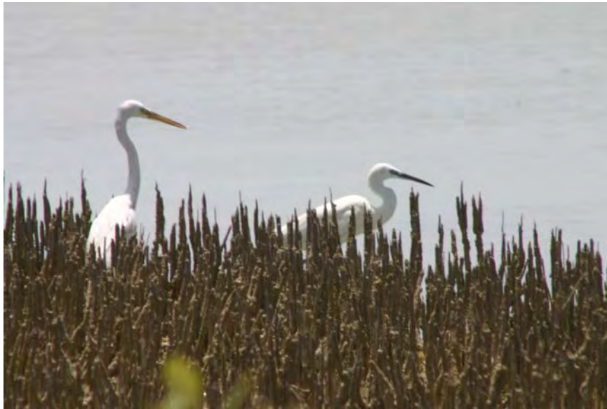
Figure 6 Western Reef Heron

This common resident breeder breeds in most mangrove stands and islands of the Egyptian Red Sea. There is a large old abandoned nest on the ground about 5 km south of Abu Ghusoon, indicating how peaceful and undisturbed the Red Sea coast must have been until quite recently. The species continues to flourish along the Red Sea and can be commonly