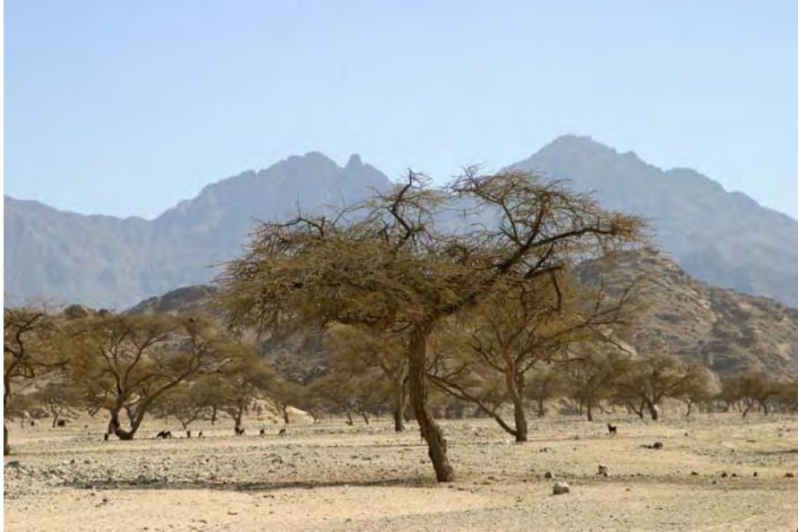
Figure 2 Wadi Abu Ghusoon with Gebel Hamata in the background

The main geographical focus of this guide is WGNP and the area immediately adjacent to it. However, since the visitors to the Park will be traveling through other parts of the Red Sea and Eastern Desert, a few other points of interest for birdwatchers, scattered between Hurghada and Shalateen are highlighted as well. This is not a comprehensive listing of birds that can be seen near the Red Sea, but rather points of interest that can be checked on the journey up and down the Red Sea that can add a few more species for the enthusiastic birder.