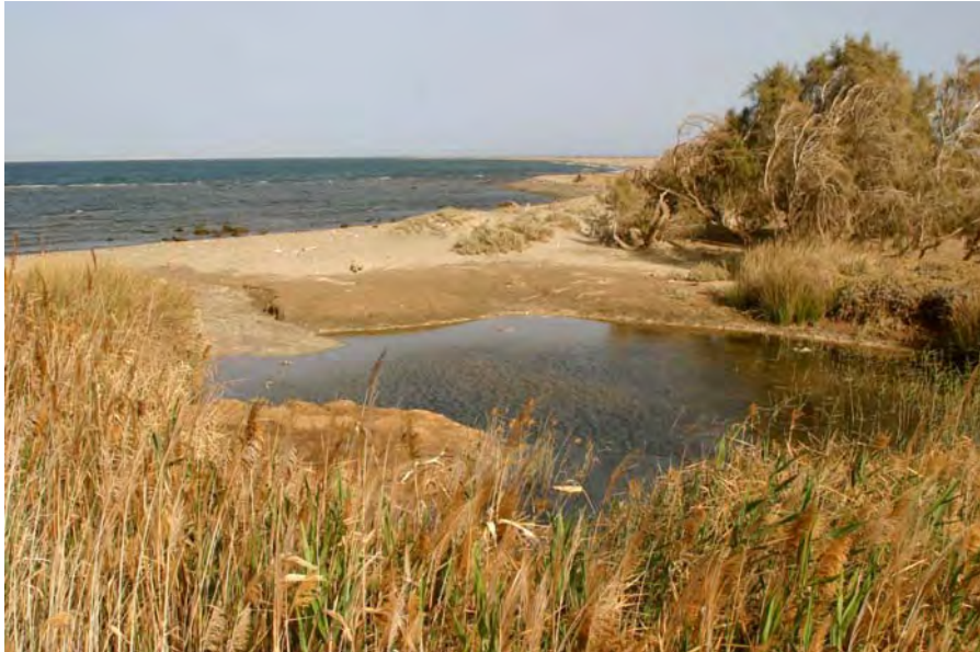
Figure 21 Swamp vegetation, Wadi el-Gemal delta

You can reach here by walking along the coast from the Shams Alam Hotel, or by parking near the Dom Palms Hypaene thebica near the highway.