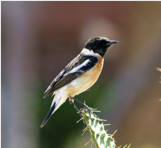
Figure 19 Siberian Stonechat at Shams Alam Hotel

A fairly common migrant and winter visitor, every hotel garden south of Marsa Alam has a few of these birds. Small numbers are also found in well-vegetated wadis such as Wadi el-Gemal. The Siberian Stonechat was classified as a subspecies of the Common Stonechat (as Saxicola torquata maurus ), but DNA analysis, together with other evidence confirmed that this is a distinct species.